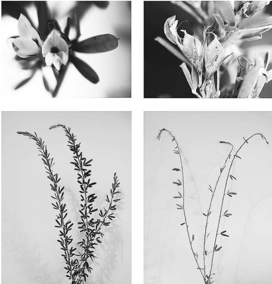
PLATE 1. (Top left) Chasmogamous flowers of Lespedeza cuneata . Photo credit: M. Schutzenhofer. (Top right) Two chasmogamous fruits of L. cuneata . Photo credit: M. Schutzenhofer. (Bottom left) A medium-sized L. cuneata individual in the control (ambient herbivory) treatment. Photo credit: T. Knight. (Bottom right) A medium-sized L. cuneata individual in the 80% augmented herbivory treatment. Photo credit: T. Knight.

thermore, biological control can have unintended consequences (e.g., Pearson and Callaway 2003, Louda and Stiling 2004). Therefore, investigating the likelihood that biological control will be effective is of primary importance. Simulating enhanced herbivory and using demographic modeling can rapidly assess the likely effectiveness of a biological control agent and pinpoint the vital rates on which biological control should focus. Information gathered from these methods may help to increase the success rate of biological control and reduce the ecological and economic risk associated with introducing biological control agents.